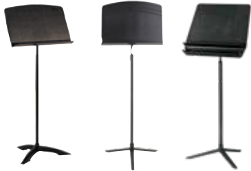
Classic 50® Music Stand

The ultimate solution for transporting all your teaching essentials from room to room, building to building, with special features that make it ideally suited to any teaching curriculum.