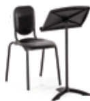
CHAIRS & STANDS